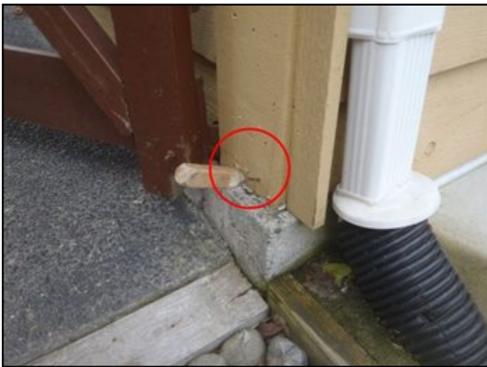
Rotted post bottom