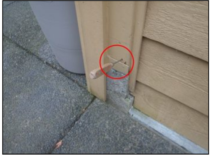
Rotted post bottom