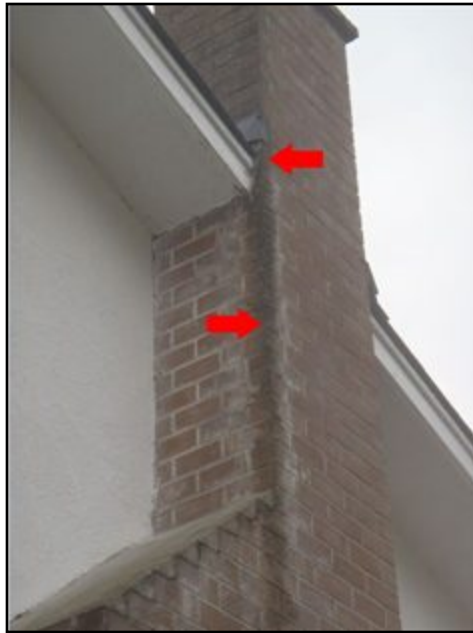
Water run-off path noted