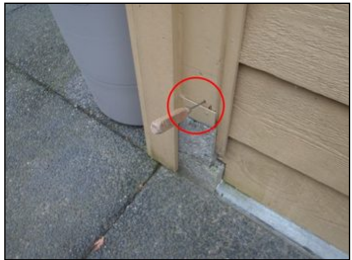
Rotted post bottom

The subject property is an approximately 35 year old, two storey, wood frame detached house built slab-on-grade with attached garage. Refer to the body of the report for improvement recommendations.