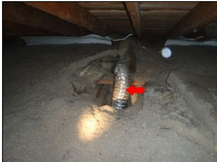
Kitchen fan ductwork