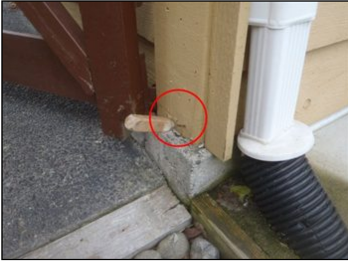
Rotted post bottom