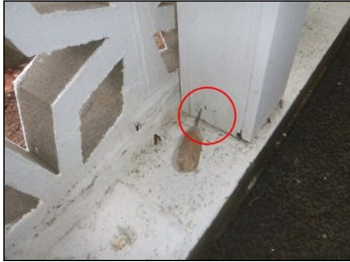
Rot in Carport post